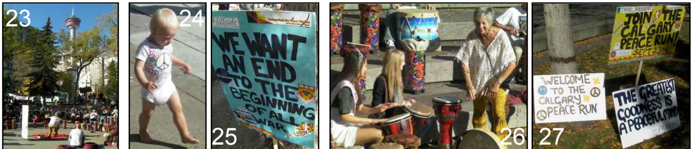
International Day of Peace 8 celebration at City Hall Calgary, September 21, 2012