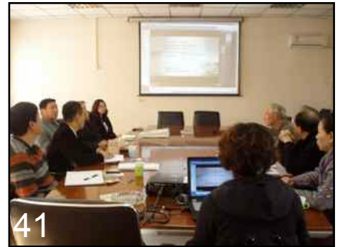
Presentations for public in Vancouver, Hakka Conference in Xi'an and government in Beijing

D) Collaborative Research & Arrangements: our international team would consist of: